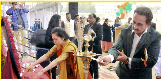
Kr. Kirti Vardhan Singh Member of Parliament