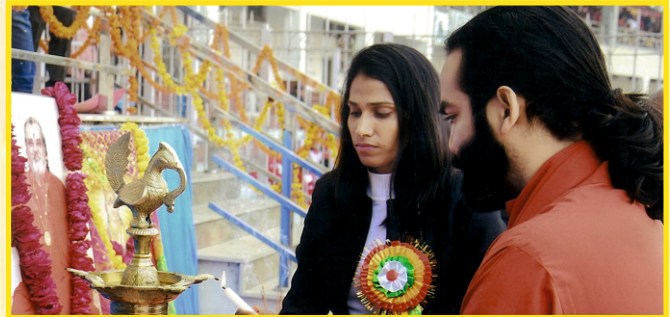
Padma Shri Ms. Sudha Singh Asian Games Gold Medalist and India Olympic Athlete