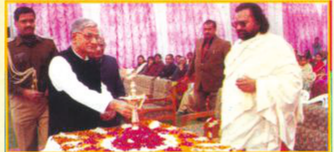
Bhai Mahavirji, former Governor of Madhya Pradesh inaugurated the Craft and Project Exhibition 2006