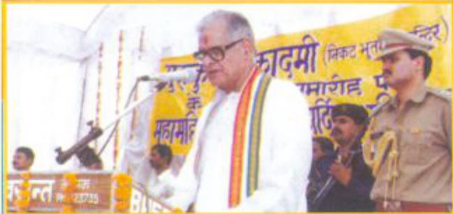
The School was inaugurated by His Excellency Former Governor Late Shri. Vishnukant Shastri